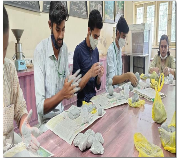
Eco Friendly Ganesh Murti Preparation workshop Organised by K. K. Wagh College Of Agriculture On 17th August, 2021.