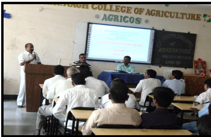
Parents Meet of third year student arranged on 22 nd August, 2016