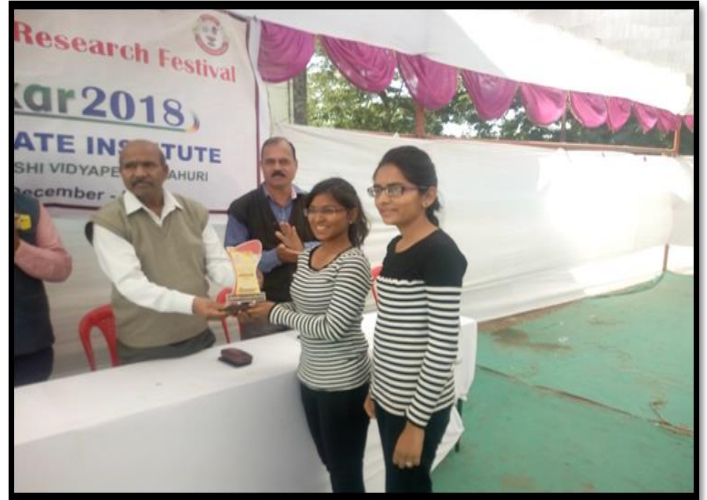
“AVISHKAR 2018” 28 th - 29 th December, research festival held at Post Graduate Institute MPKV