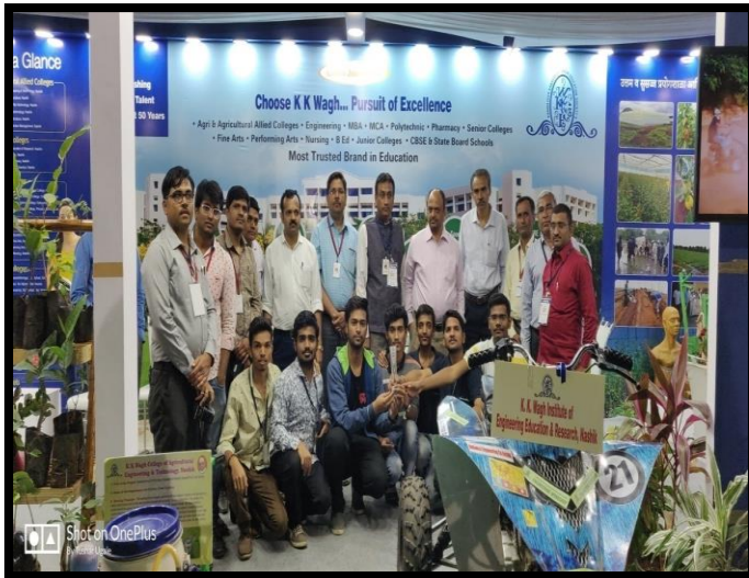
Krishithon -2018-19 Exhibition from 22th to 26th November, 2018