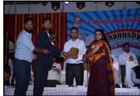
Prizes receiving by the students at the Hands of Dignitaries during Prize distribution ceremony of Indradhanushya - Intercollegiate Youth Festival 2022