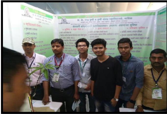
Students actively participated in the 'Krishithon' Exhibition, 2016 held at Nashik.