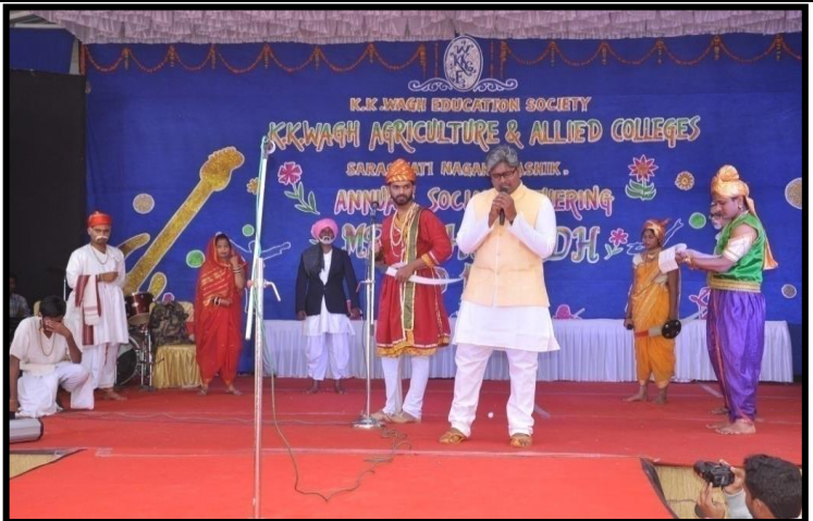
Students participated in Mudhghandh 2016