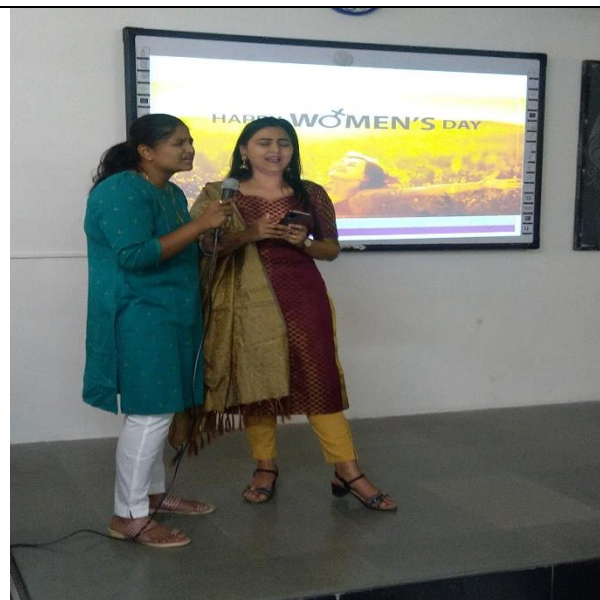
Celebrated “International Women’s Day” on 8 th March, 2022