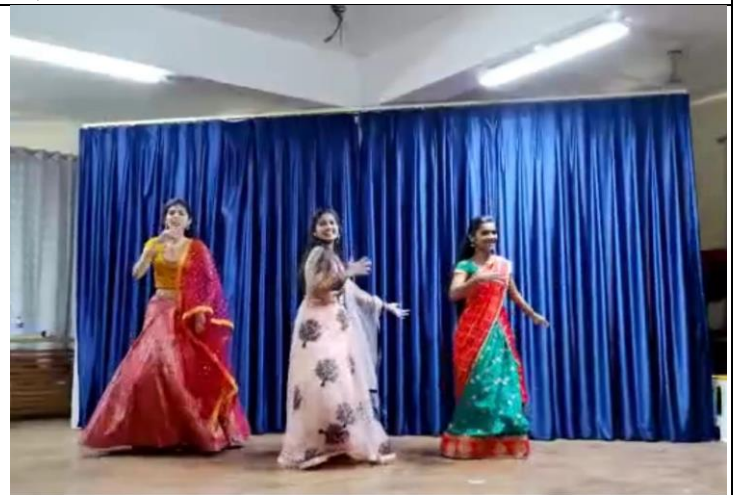
Celebrated Annual Social Gathering on 26 th to 27 th March, 2022.