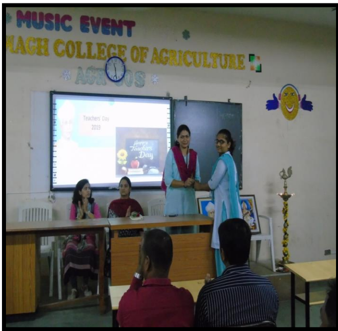
Teacher's day on 5th Sept, 2019