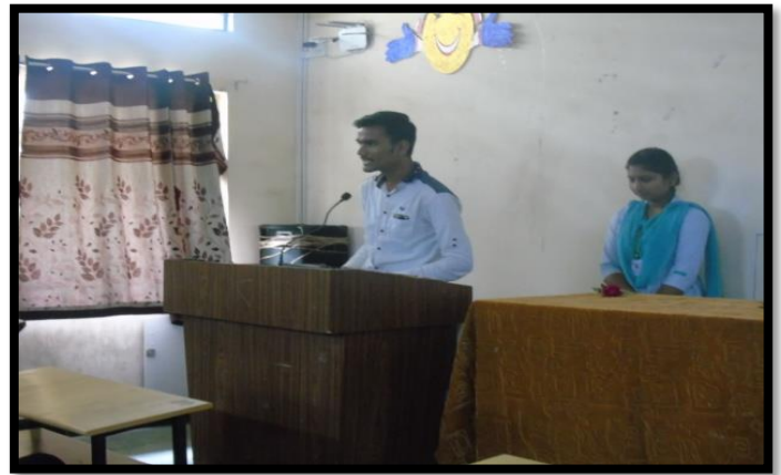
Orientation Programme of batch 2019-20 on 27th Sep, 2019.