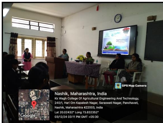
Celebration of Agricultural Education Day on 3 rd December 2024