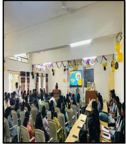
Celebrated Teachers Day on 5 th Sep. 2024