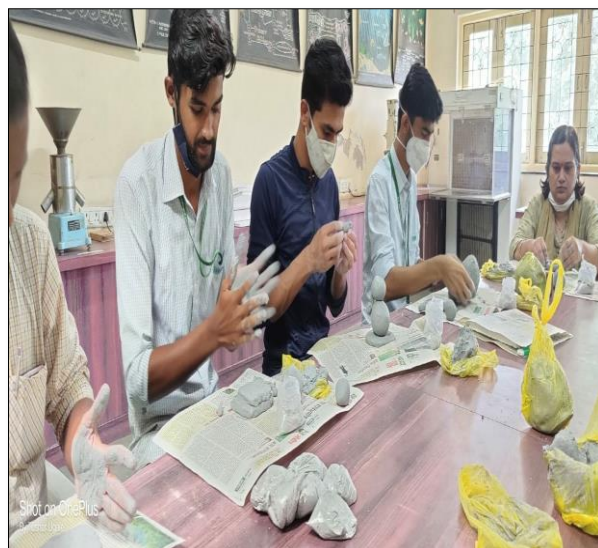
Eco Friendly Ganesh Murti Preparation workshop Organised by K. K. Wagh College Of Agriculture On 17th August, 2021.