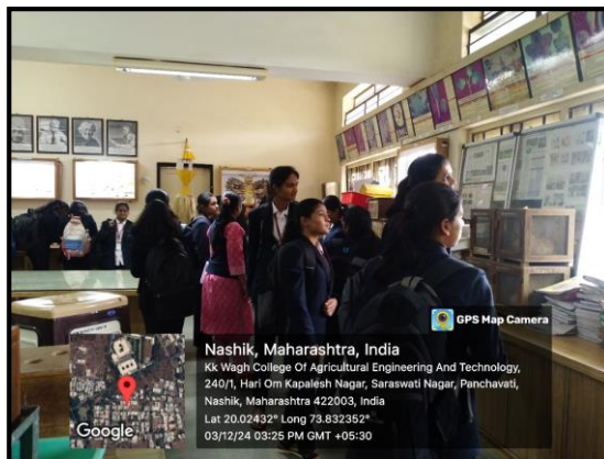
Student visit at Departments on the occasion of Agricultural Education Day