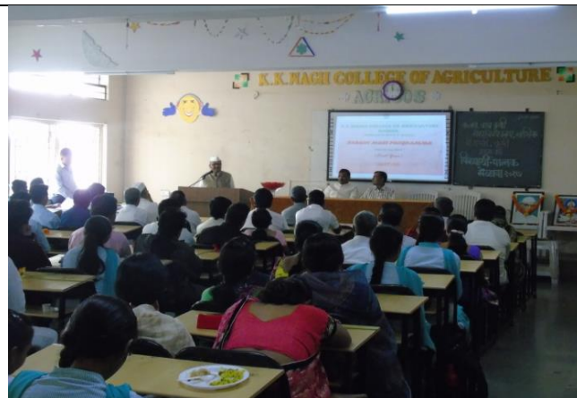
Parents meet of first year students arranged on 25 th November 2017