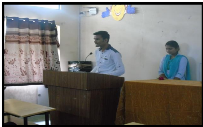
Orientation Programme of batch 2019-20 on 27th Sep, 2019.