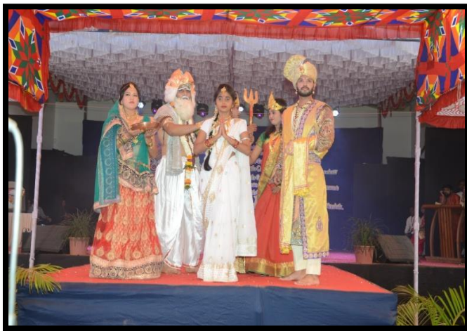
Performance by Students in Annual Social Gathering -2018.