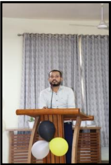
Deeksharambh (Induction Programme) of batch 2024-25 on 18 th & 19 th Sept., 2024