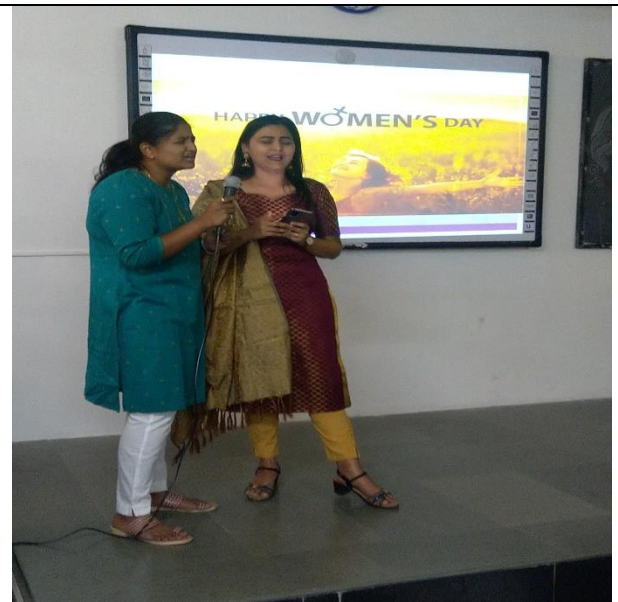
Celebrated " International Women's Day " on 8 th March, 2022