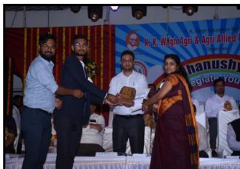
Prizes receiving by the students at the Hands of Dignitaries during Prize distribution ceremony of Indradhanushya - Intercollegiate Youth Festival 2022