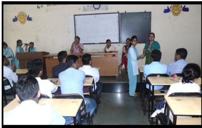
Teacher”s day on 5th Sept,2019