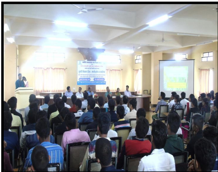
Arranged Agriculture Education Day on 30th June, 2017 to create awareness about Agricultural education by explaining scope of Agricultural education to the 12th Standard Pass out Students.