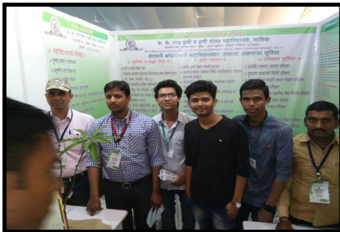
Students actively participated in the 'Krishithon' Exhibition, 2016 held at Nashik.