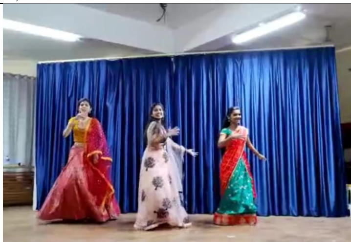
Celebrated Annual Social Gathering on 26 th to 27 th March, 2022.