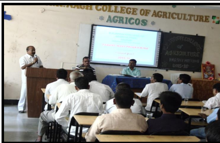
Parents Meet of third year student arranged on 22 nd August, 2016