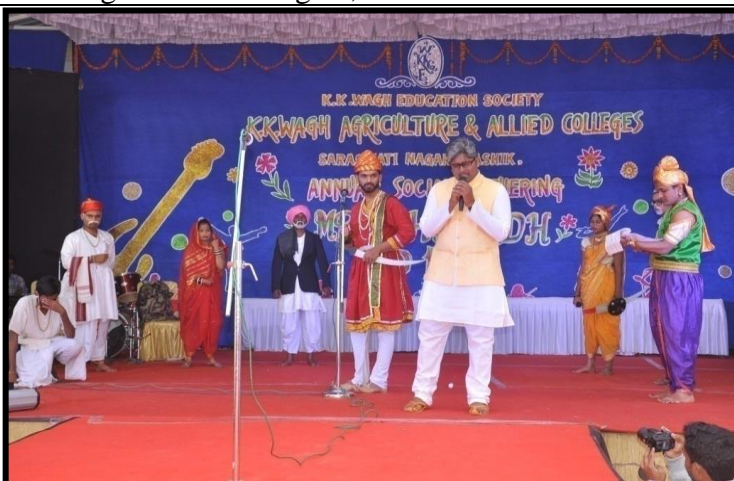
Students participated in Mudhghandh 2016